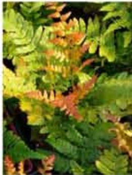
Dryopteris erythrosora 'Brilliance'