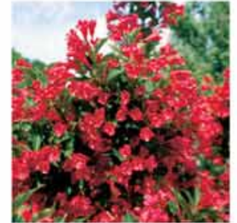
Weigela florida 'Red Prince'