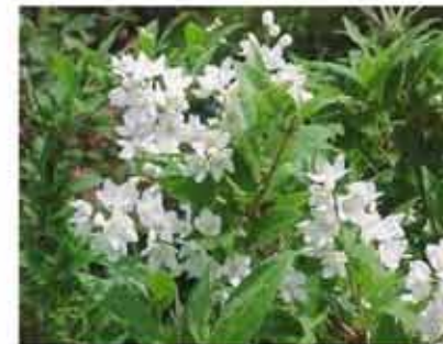
Deutzia gracilis 'Nikko'