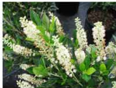
Clethra alnifolia 'Sixteen Candles'