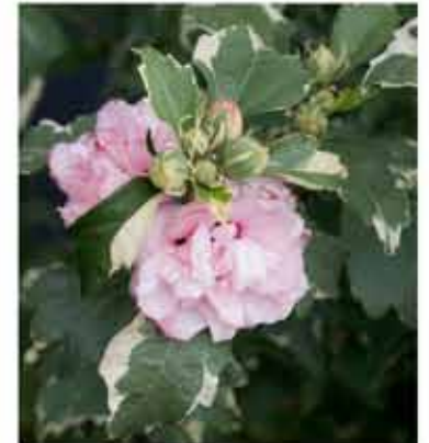
Hibiscus syriacus 'Sugar Tip'

Solow Horticultural Designs Plant Photos for: Do-It-Yourself Homeowner