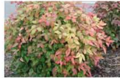
Nandina domestica 'Firepower'