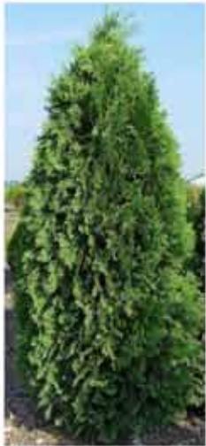
Thuja occidentalis 'Nigra'