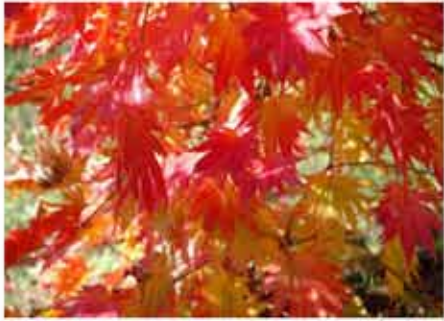
Acer japonicum 'Filicifolium'