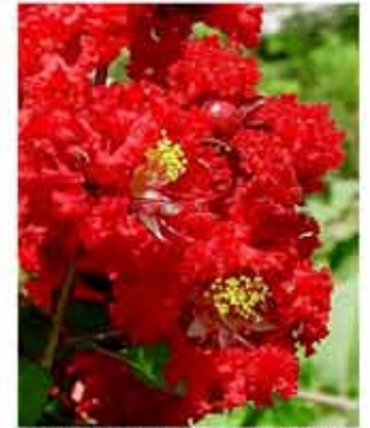
Lagerstromia indica 'Dynamite' (multistem)