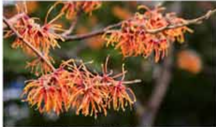
Hamamelis x intermedia 'Jelena'