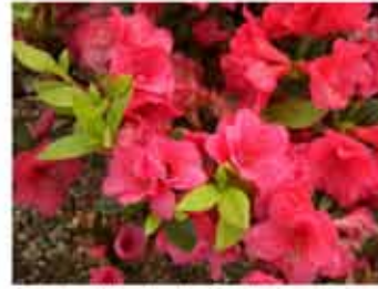
Azalea 'Hershey's Red'