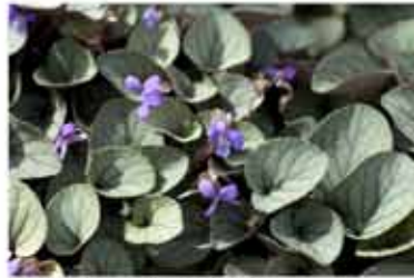
Viola walteri 'Silver Gem'