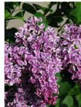
Syringa vulgaris 'Sensation'