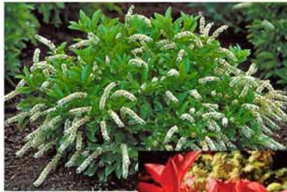
Itea virginica 'Little Henry'