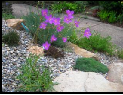
Phemeranthus calycinus , my new favorite plant

art of Bonsai. I've done some ruthless pruning and highly recommend it. As a landscape designer with degrees in landscape architecture and horticulture, I enjoy visiting Japanese and Chinese gardens both here and overseas. This style is only one of many seen in the digital designs I complete for contractors in addition to creating and presenting lectures that focus on perennials, design, marketing, and travel.