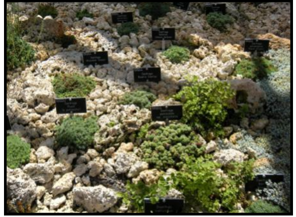
My Sources of Inspiration (From Top) Denver Botanic Garden Montreal Rock Garden Betty Ford The Wisley saxifrage collection