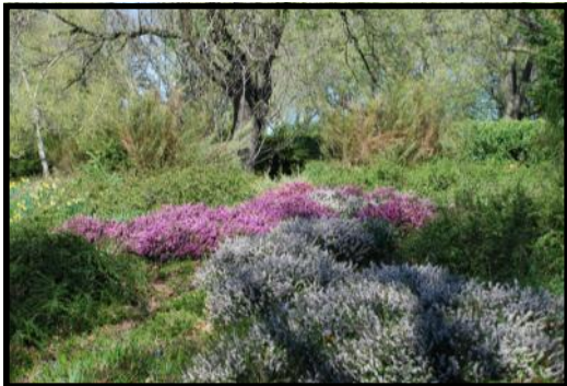
Erica at Fort Tryon