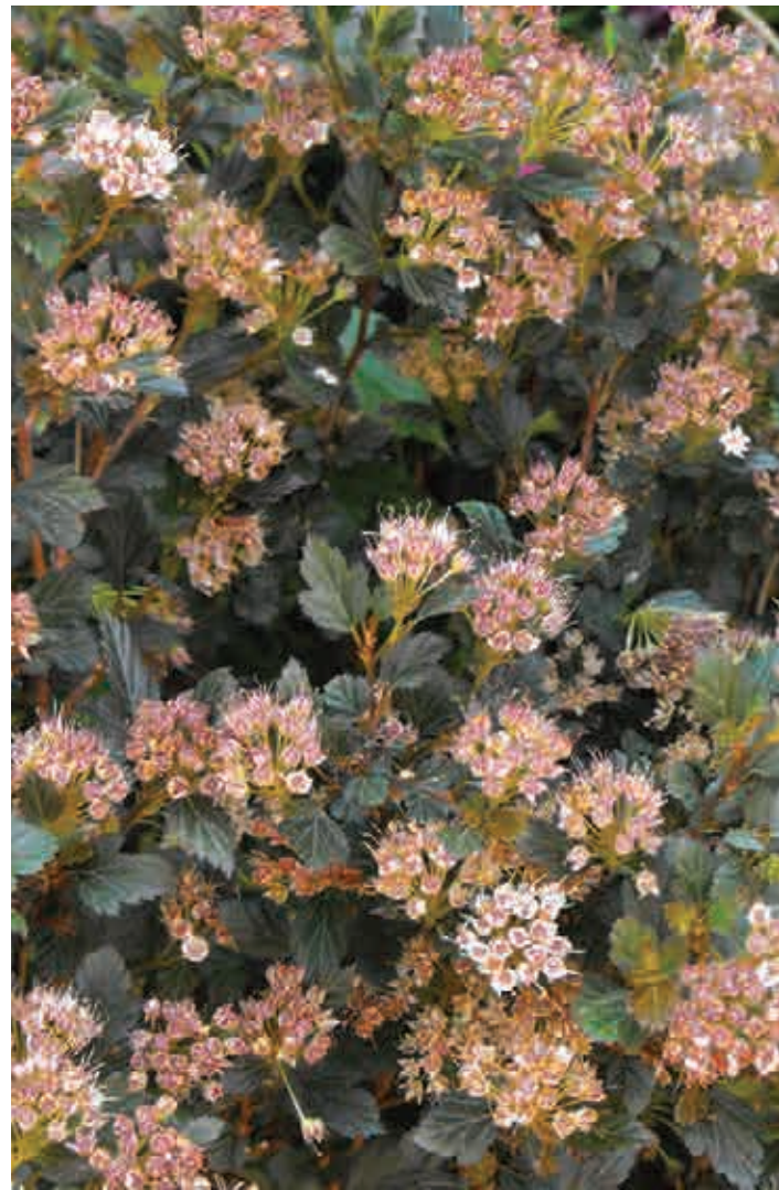
Above left: The sound of water enhances the tranquility of the garden. Above right: The dwarf ninebark Little Devil™ ( Physocarpus opulifolius Little Devil™) has dark foliage, pinkish-white flowers and exfoliating bark.

and Sedum album 'Athens'. Just a couple of steps away is the dwarf Little Devil™ ninebark ( Physocarpus opulifolius Little Devil™) with its dark foliage, pinkish-white flowers and exfoliating bark. Hedge maple ( Acer campestre ) and Japanese maple 'Linearilobum' ( Acer palmatum 'Linearilobum') have a home there too. Tucked under the trees and shrubs are lilies ( Lilium spp.), hosta, oakleaf hydrangea ( Hydrangea quercifolia ), bell flowers ( Campanula spp.) and a small Hinoki cypress ( Chamaecyparis obtusa 'Nana').