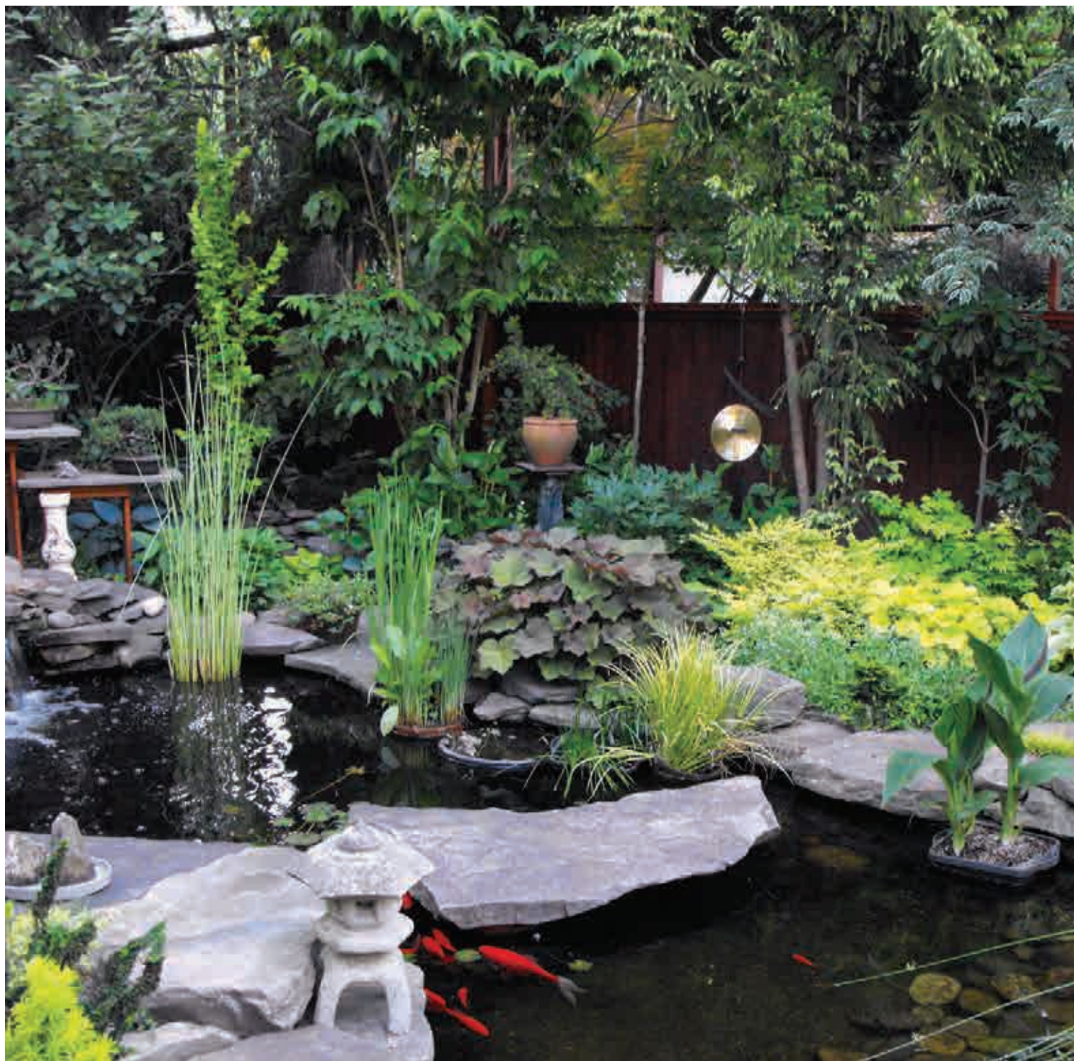
This part of the garden features a large koi pond with a waterfall sheeting off a flat rock, the raked tranquility garden, bonsai and a hand-stained bamboo fence.

This small suburban Philadelphia garden is a series of spaces that form one cohesive oasis.